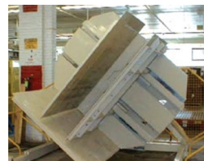
CUSTOM-SIZED TABLE: Larger and smaller platforms available for custom-sized loads