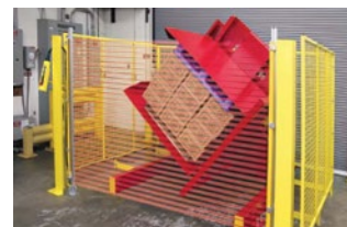
LIGHT CURTAINS: Provides a soft guarding across the front of the machine for additional protection