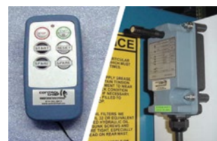
WIRELESS REMOTE: Receiver mounts to machine