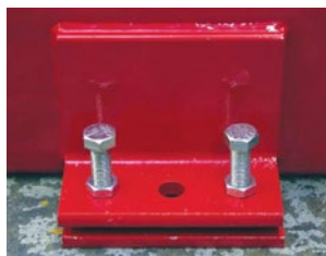
LEVELING JACK PLATES: Levels floor plate on uneven flooring