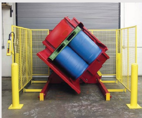
QUICKLY INVERT DRUMS TO MIX CONTENTS, PROHIBIT MOLD GROWTH, OR TRANSFER TO IN-HOUSE PALLETS