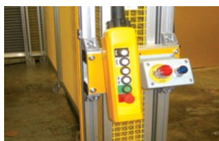
PUSH BUTTON: For safe and easy operation (standard)