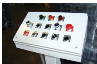
CONSOLE: Angle-top control with pedestal