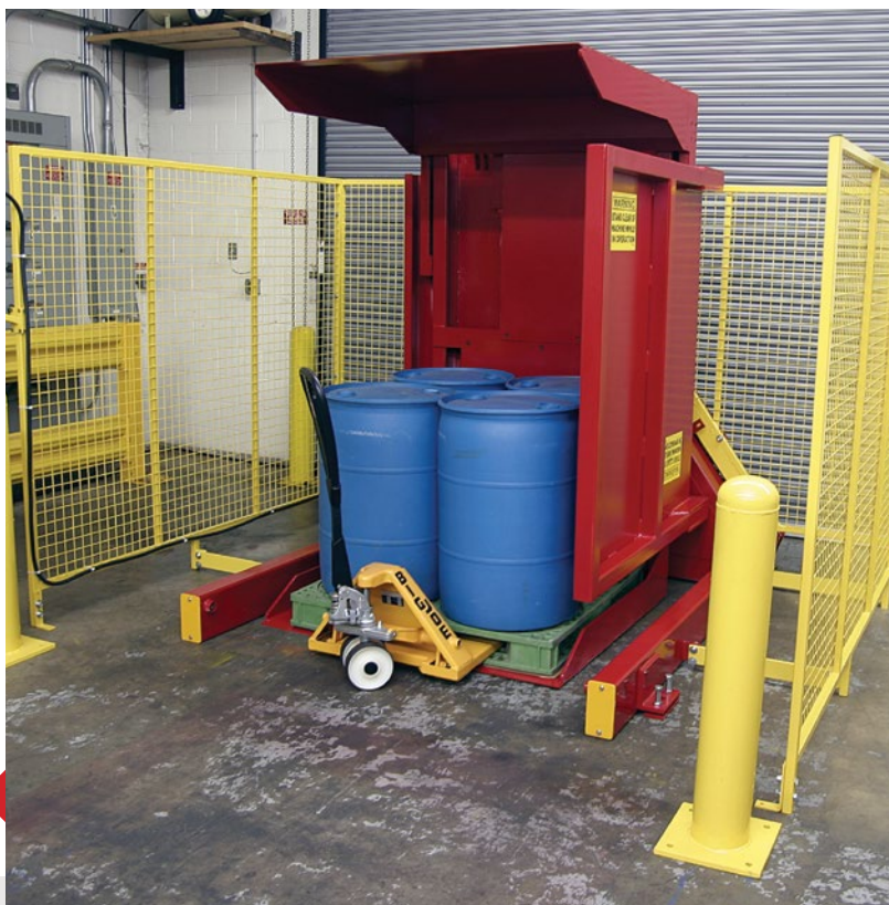
GROUND LEVEL LOADING WITH A MANUAL OR ELECTRIC-POWERED PALLET JACK