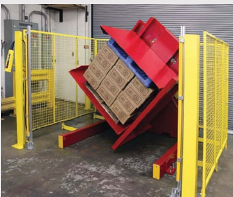
DUAL PLATES TRAVEL IN UNISON; NEAR-PERFECT CENTER BALANCE PROVIDES SMOOTH INVERSION OF TALL OR SHORT PARTIAL LOADS