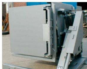
CUSTOM PAINT FINISHES: Stainless steel, food-grade Steel-It, and custom color match paint