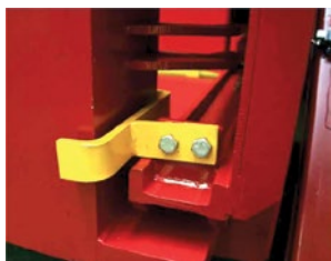
LOCK OUT BAR: Prevents plates from moving when maintenance is required