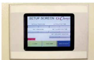
HMI OPERATOR INTERFACE: Offers multiple screens for maintenance and pressure settings