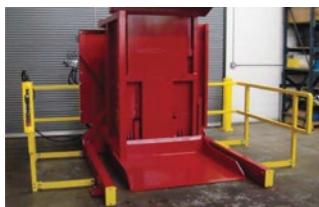
STANDARD MACHINE GUARDING: Provides protection from forklifts